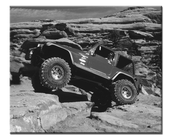
The choice of Rock Crawlers, Mudboggers, Trail Blazers, Desert Racers, Off-Roaders everywhere including Pike's Peak, Baja 1000 and Paris to Dakar.